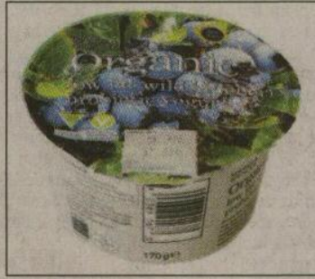
M&S low fat wild blueberry yogurt, €0.79 for 170g; €4.64 per kg

Verdict: Lovely and creamy but very sweet Star rating: ★★★