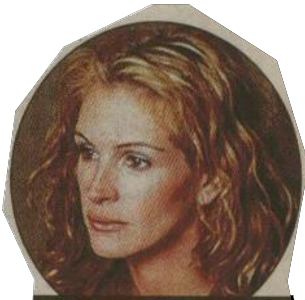
STAR: Julia Roberts in Erin Brockovich

University College Dublin today as part of Glenisk Organic Dairy's celebrations for National Organic Week.