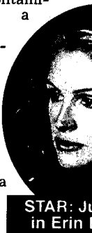
STAR: Julia Roberts in Erin Brockovich

"I would want her to eat," said Ms Brockovich.